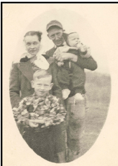
Hazel's handwriting on back